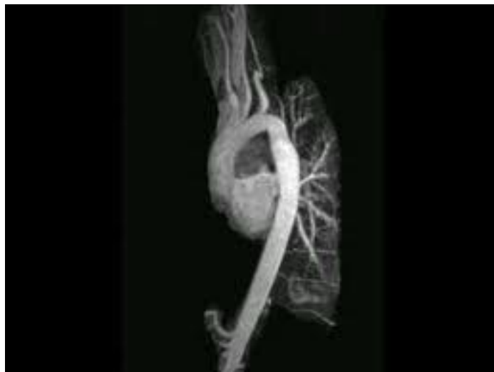
Fig 1: a cardiac MRI scan showing the heart of a patient and one of their lungs

The main focus of these direct imaging techniques currently is in the detection of narrowing of blood vessel walls due to the build up of fatty deposits (atherosclerosis) and of recurrence of vessel narrowing (restenosis) following treatments such as angioplasty and stents. The early detection of cardiovascular disease is beneficial, enabling early intervention through improved diet and increased exercise, monitoring of the disease process, and traditional treatments such as statins and other drugs to reduce cholesterol and blood pressure respectively.