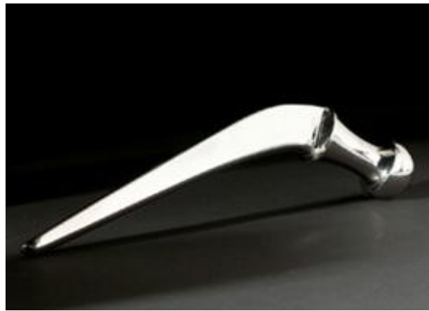
Figure 2. Hip Implant with nano-textured surface to encourage bone tissue to bond to it.

almost as soon as the implant is fitted and will stimulate the osteoblasts (bone-forming cells).